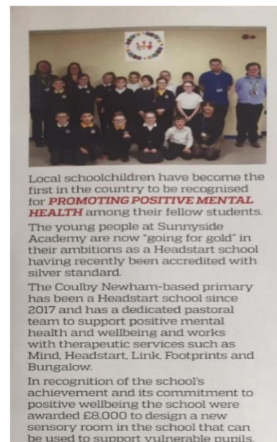
Local schoolchildren have become the first in the country to be recognised for PROMOTING POSITIVE MENTAL HEALTH among their fellow students. The young people at Sunnyside Academy are now "going for gold" in their ambitions as a Headstart school having recently been accredited with silver standard. The Coulby Newham-based primary has been a Headstart school since 2017 and has a dedicated pastoral team to support positive mental health and wellbeing and works with therapeutic services such as Mind, Headstart, Link Footprints and Bungalow. In recognition of the school's achievement and its commitment to positive wellbeing the school were awarded £8,000 to design a new sensory room in the school that can be used to support vulnerable pupils.